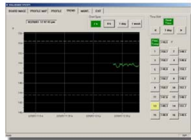
Process temperature over time (shown for 2 hour intervals)